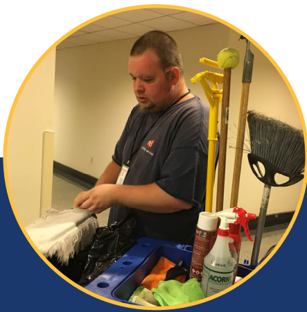
Noble Janitorial Services