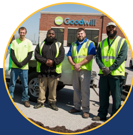
Goodwill of Central & Southern Indiana Building and Grounds Services

For more information about Noble Employment and Workforce Services (N.E.W.S) programs: www.mynoblelife.org/services/employment/community-employment/