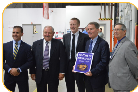
Indianapolis, IN Mayor Joe Hogsett