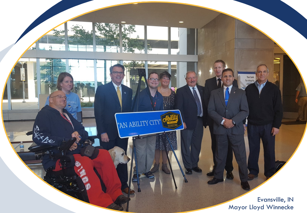
Evansville, IN Mayor Lloyd Winnecke